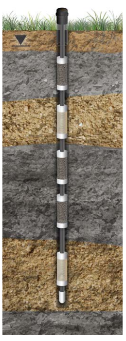
Typical 3-Channel CMT Installation in Overburden with Bentonite and Sand Cartridges

\begin{tabular}{ll} \textbf{Saves Cost} &- through reduced permitting and drilling costs; and because narrow tubes allow smaller purge volumes, reduced disposal costs, efficient low flow sampling and rapid response to pressure changes, all reduce field time. \end{tabular}