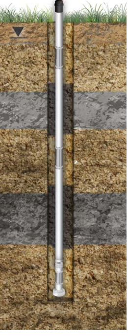
Typical 3 or 7-Channel CMT Installation using Layers of Bentonite and Sand Backfilled from Surface