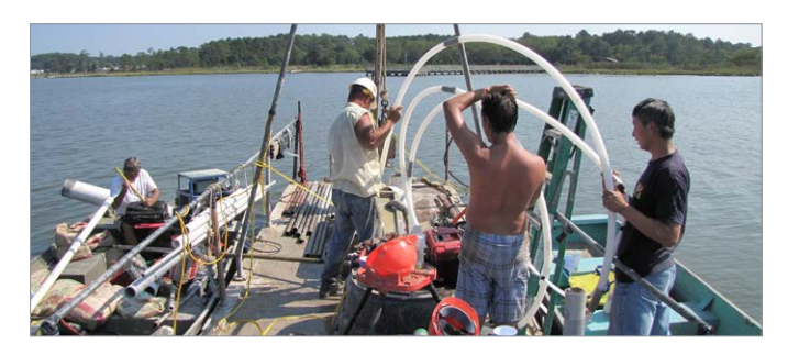
CMT Systems were installed at the bottom of a bay to measure submarine groundwater discharge. Eight 7-Channel CMT Systems were installed, with custom modifications to suit the open water application. Watertight wellheads had to be custom built to allow for sampling from the surface of the bay using a peristaltic pump.