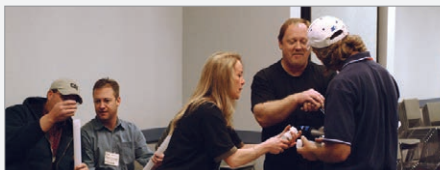
The first CMT contractor training course, conducted at the NGWA Expo in Las Vegas, December 2004. Contractors are being instructed on proper port construction.