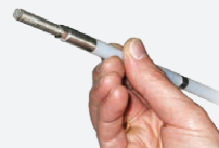
Model 408M DVP 3/8" (9.5 mm)