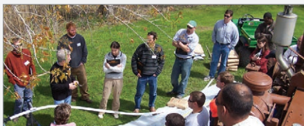
Outdoor installation/ demonstration at premises of Parrat-Wolff, Environmental and Geotechnical Drilling Services, Syracuse, New York.