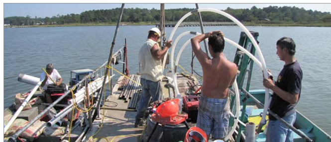
CMT Systems were installed at the bottom of a bay to measure submarine groundwater discharge. Eight 7-Channel CMT Systems were installed, with custom modifications to suit the open water application. Watertight wellheads had to be custom built to allow for sampling from the surface of the bay using a peristaltic pump.