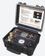
Model 464 Electronic Control Unit