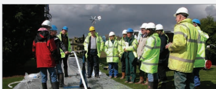
CMT Installation and training as part of a “Multilevel Course” given by the University of Cranfield at Silsoe, U.K., in conjunction with Waterra (UK), British Geological Survey & Norwest Holst.

Please contact Solinst should you wish to attend or set up a training session.