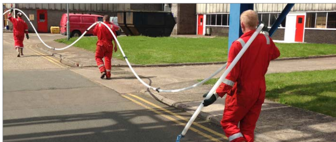
Nineteen 7-Channel CMT Systems were installed inside a manufacturing facility to characterize and monitor a plume beneath the building that is migrating off site. Systems were installed using sonic drilling to 30 m (100 ft) depths. Challenging geology made drilling and installation tricky, however, all Systems were installed in two weeks.