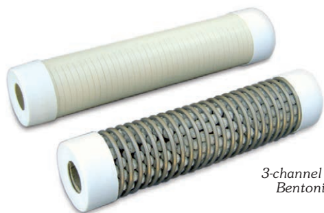
3-channel CMT Sand and Bentonite Cartridges

These cartridges are approximately 2.4" (61 mm) in diameter and will fit inside various direct push drill rods. Ideally, the borehole diameter these bentonite cartridges are used in should not exceed a nominal 3.5" (90 mm), to ensure proper expansion and sealing.