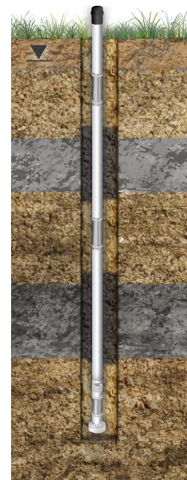
Typical 3 or 7-Channel CMT Installation in Overburden using Layers of Bentonite and Sand Backfilled from Surface