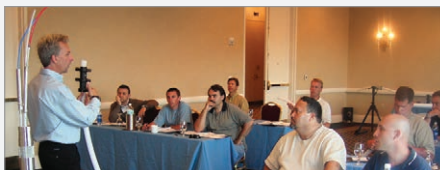
Instructing drilling contractors and consultants on CMT installation techniques at Battelle Bio-Symposium, Baltimore, Maryland.