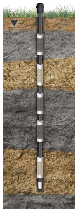
Typical 3-Channel CMT Installation in Overburden with Bentonite and Sand Cartridges

Saves Cost – through reduced permitting and drilling costs; and because narrow tubes allow smaller purge volumes, reduced disposal costs, efficient low flow sampling and rapid response to pressure changes, all reduce field time.